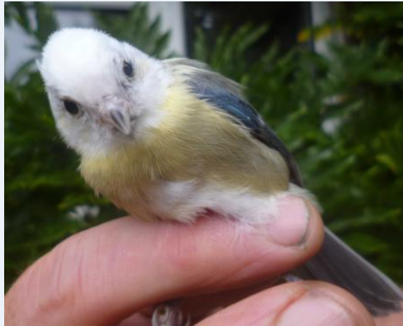
A leucistic Blue Tit near Abermule, Sept 2016