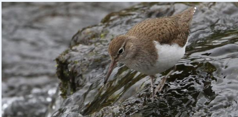
Common Sandpiper at Pwll Penarth, April 2016

Reported in the county from 23rd Mar to 31st Oct when birds were seen at Caersws. In between these dates breeding attempts will undoubtedly have been made on county rivers and water bodies.