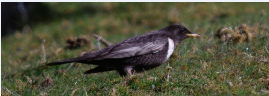
Male Ring Ouzel at Lake Vyrnwy, April 2016

At least one male was present at the traditional Lake Vyrnwy passage site (y Gadfa) from 13th to 20th April. A male carrying food near Llangynog on 6th June was an excellent record. The final sighting of 2016 was a singleton on 20th Oct with winter thrushes at Long Mountain.