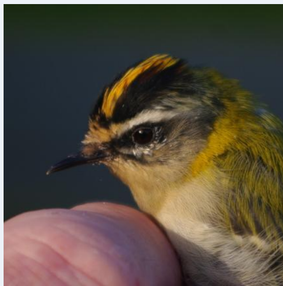
Firecrest, Lake Vyrnwy, October 2016

A male was trapped and ringed at Lake Vyrnwy on 2nd Oct. Another was at Pwll Penarth on 18th Dec.