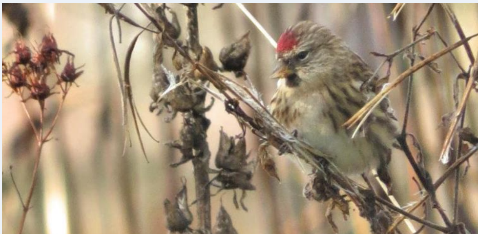
Lesser Redpoll at Wern, January 2016

There were relatively few records in Spring 2016 with scattered breeding reports received during the summer. A large flock at Lake Vyrnwy in the autumn peaked at 200+ on 2nd Oct.