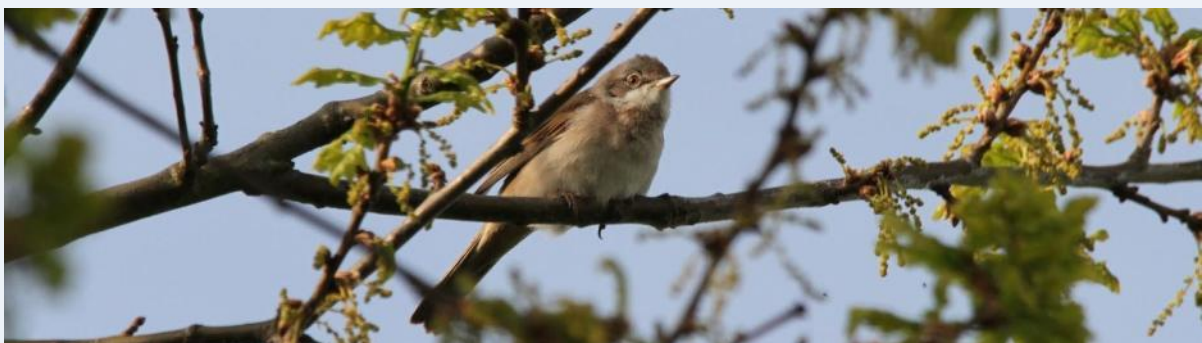
Whitethroat, Montgomeryshire, May 2016

Present in the county from 24th Apr (Dolydd Hafren) to 17th Aug (also at Dolydd Hafren).