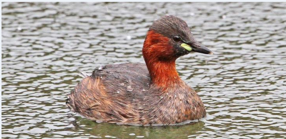
Little Grebe at Pwll Penarth, March 2016