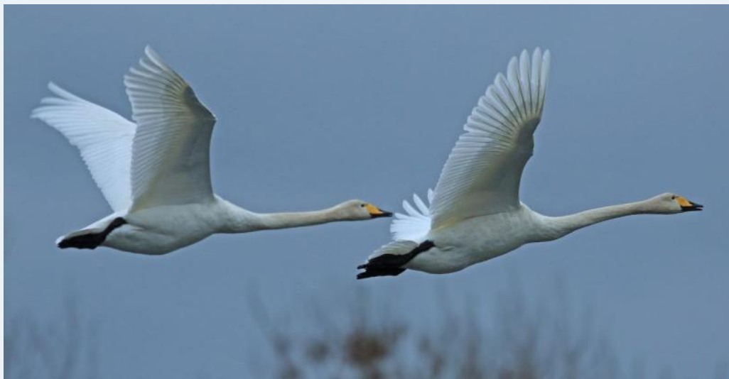
Whooper Swans at Llyn Coed y Dinas, December 2016

Present from 12th Jan to 13th Mar at Aberhafesp, with a peak count there of 15 on 5th March. 3 flew down river at Cors Dyfi on 23rd March. 2 were at Dolydd Hafren on 5th and 9th Oct, and 9 at Lake Vyrnwy on 3rd Nov, with 3 different individuals also there on 7th Nov. 8 birds were at Aberhafesp (6 adult, 2 juvenile) on 8th Dec and there were 3 at Llyn Coed y Dinas on 11th Dec.