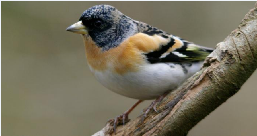
Male Brambling at Lake Vyrnwy in March 2016

There were very few records in the 2nd winter period. The first seen was at Lake Vyrnwy on 14th Oct, with a high count of 75+ at Caersws on 31st Oct.