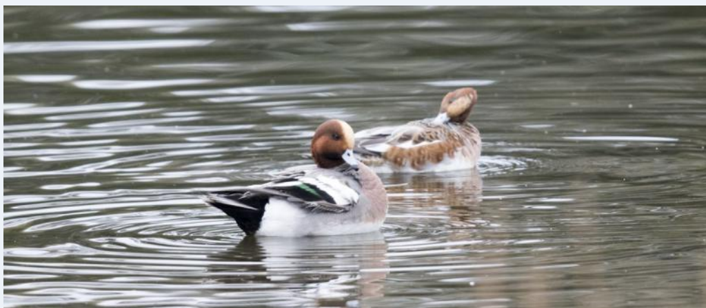
Wigeon at Llyn Coed y Dinas, October 2016 by Edd Cottell