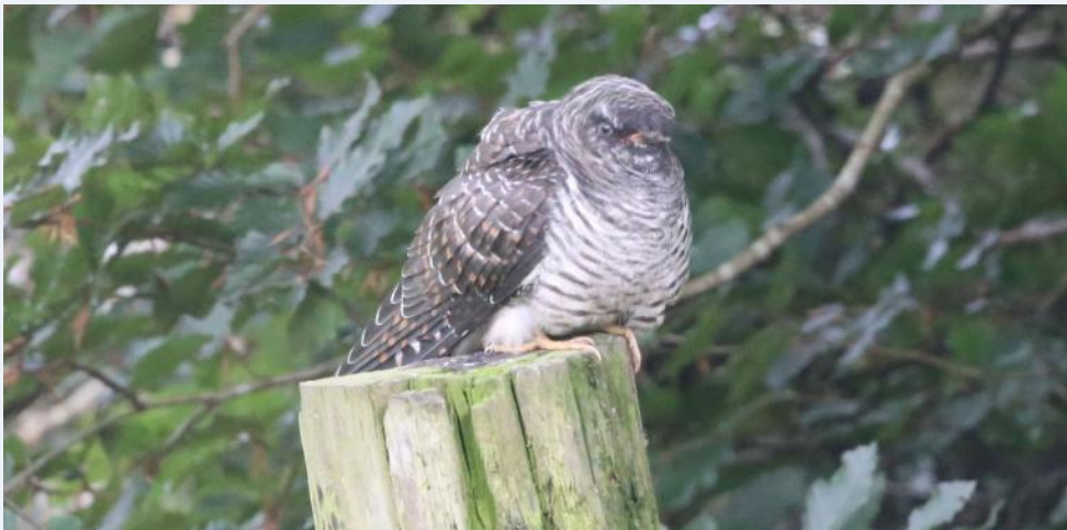
Juvenile Cuckoo in the Dyfnant Forest

Scattered, sparse records. The first of the year was at Cors Dyfi on 20th Apr.