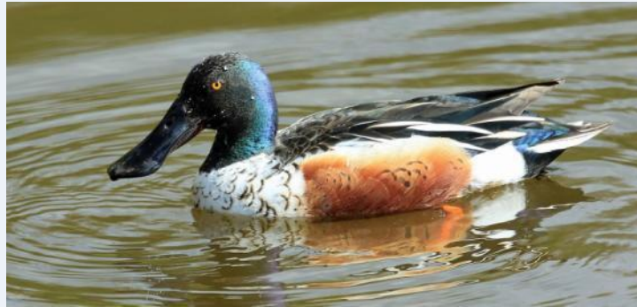
Drake Shoveler at Llyn Coed y Dinas, April 2016

Very scarce. 2 were at Llyn Coed y Dinas on 16th Apr, with up to 2 birds also there 14th Nov-8th Dec.