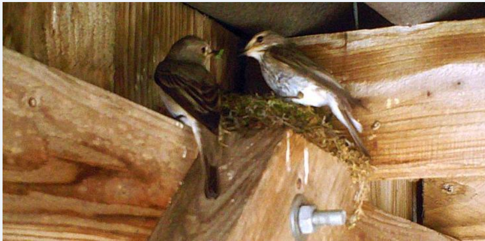
Spotted Flycatcher at nest near Llanfyllin

The first of 2016 was at Glansevern on 3rd May. Otherwise, scattered records.