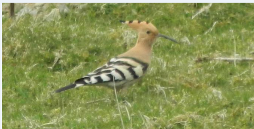
Hoopoe near Foel, May 2016

One was present near Foel between 7th-8th May.