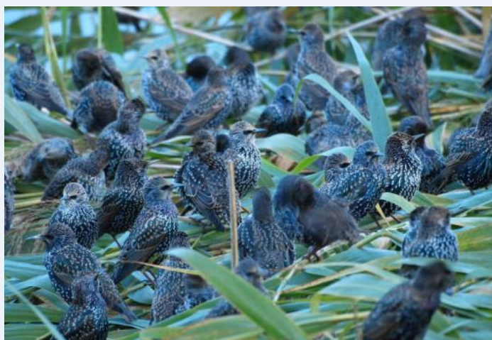
Roosting Starlings flatten the reedbed at Llyn Coed y Dinas in Nov 2016

Present. Largest flocks were c.5000 near Llanidloes on 22nd Oct, 3000+ at Dolydd Hafren on 13th Nov, and 2000+ at the same location on 27th Nov.