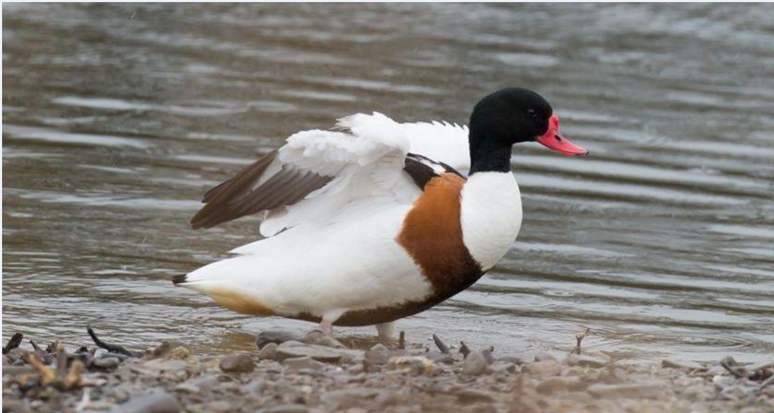
A Shelduck in the February rain at Llyn Coed y Dinas

January was relatively mild but very wet. Indeed, January 2016 was the seventh wettest January since records began in 1910. February was a bit chillier but generally mild and once again, it was wet (133% of average rainfall overall). This wet weather badly impacted Tawny Owl breeding attempts and Crossbill were notably absent.