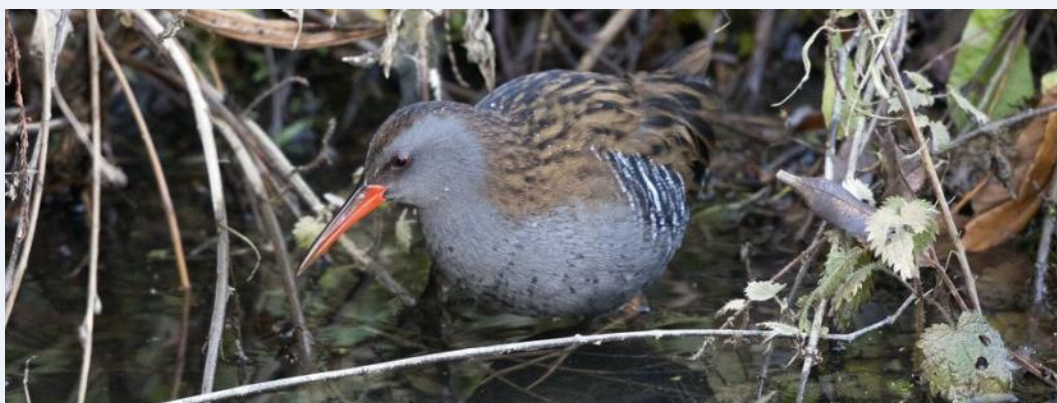
Water Rail at Llyn Coed y Dinas, November 2016

Winter records were received from the Cors Dyfi, Dolydd Hafren, The Flash (Welshpool), Llyn Coed y Dinas and Pwll Penarth. However, no sightings were reported in 2016 between May and August (so breeding is unlikely to have occurred). The highest count was 6 at Dolydd Hafren on 18th Dec.