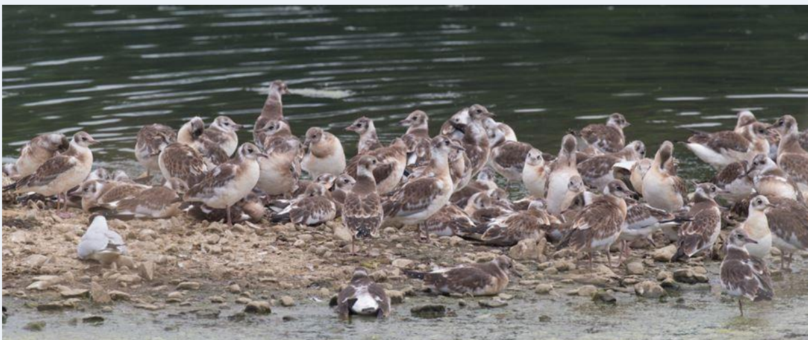
Black-headed Gull fledglings at Llyn Coed y Dinas, June 2016

420 were counted at Llyn Coed y Dinas on 23rd Mar where the birds went onto breed. By mid June, 206 chicks were estimated to have fledged with a further estimated 62 nests still underway. The highest count of the species elsewhere in the county was 82 at Llyn Mawr on 17th May.