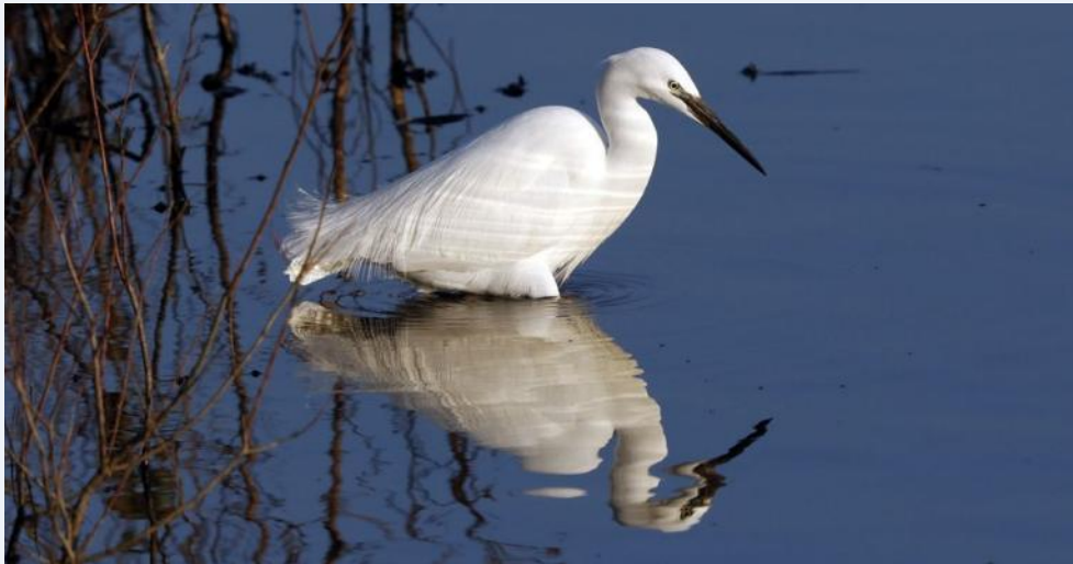
Little Egret at Llyn Coed y Dinas, December 2016

Absent from the county from May through to July. A max of 6 were at Dolydd Hafren on 14th Jan.