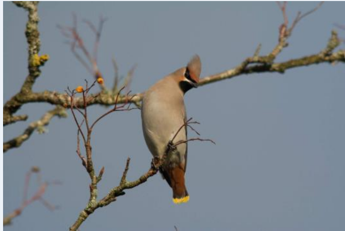
Waxwing at Machynlleth, December 2016

The first Waxwings were recorded in the county since 2013. The earliest confirmed sighting was 6 overhead at Coedway flying towards Shrewsbury on 18th Dec. A singleton was then present at Machynlleth from 20th-26th Dec. A flock of 7 enjoyed ornamental berries at Bryn du Road, Llanidloes on 27th Dec. Guilsfield held 12 on 28th Dec. From the 29th Dec, a flock of 40+ (on 30th) could be seen at various sites in Newtown. A further 12 were at Welshpool on 30th Dec.