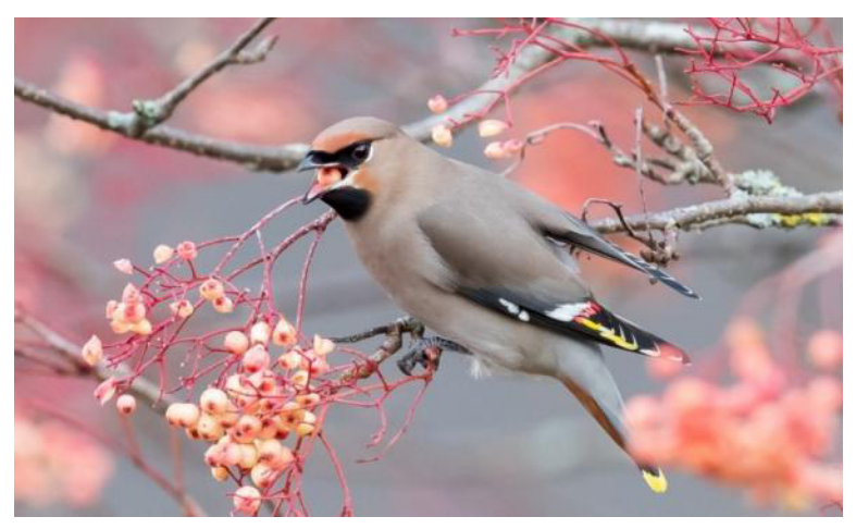
Waxwing at Newtown College, 8 Jan

This irruptive winter visitor varies widely in numbers each year. On 3 Jan, 32 were in Llanidloes and 40 in Welshpool. At Newtown College, 1 (sometimes 2) stayed from 6 to 20 Jan. The second winter period produced no county records.