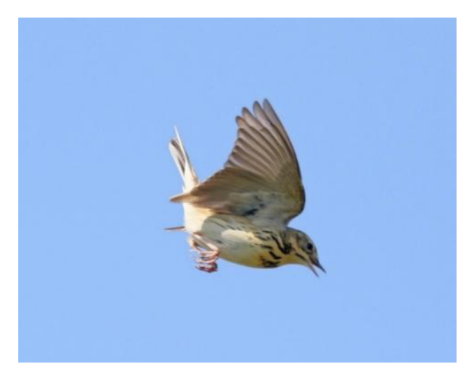
Tree Pipit at Frochas Common, 22 Apr, by Chris Townsend

Under-recorded, but a regular summer visitor on open hillsides with scattered trees used as songperches. First recorded were 3 passage birds over the Dyfi floodplain on 15 Apr.