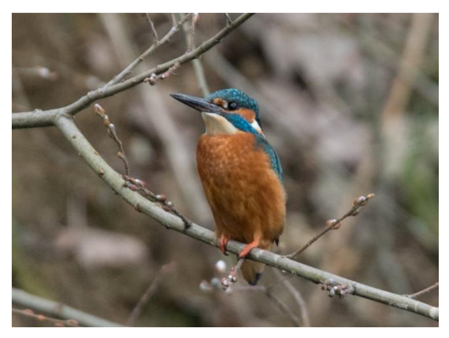
Kingfisher at Dolydd Hafren, 19 Mar

Recorded from rivers, streams and lakes throughout the county, with multiple records from Dolydd Hafren after the breeding season. In mid-winter many Kingfishers depart for the coast, but there was one record from the Severn near Newtown on 13 Dec.