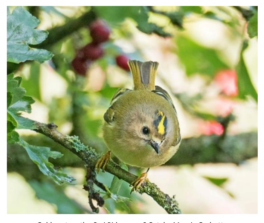
Goldcrest on the Ceri Ridgeway, 6 Oct

Many nest in the county, usually in conifers; but still more visit on autumn passage, often from Scandinavia. Commonly found in winter in suitable habitat.