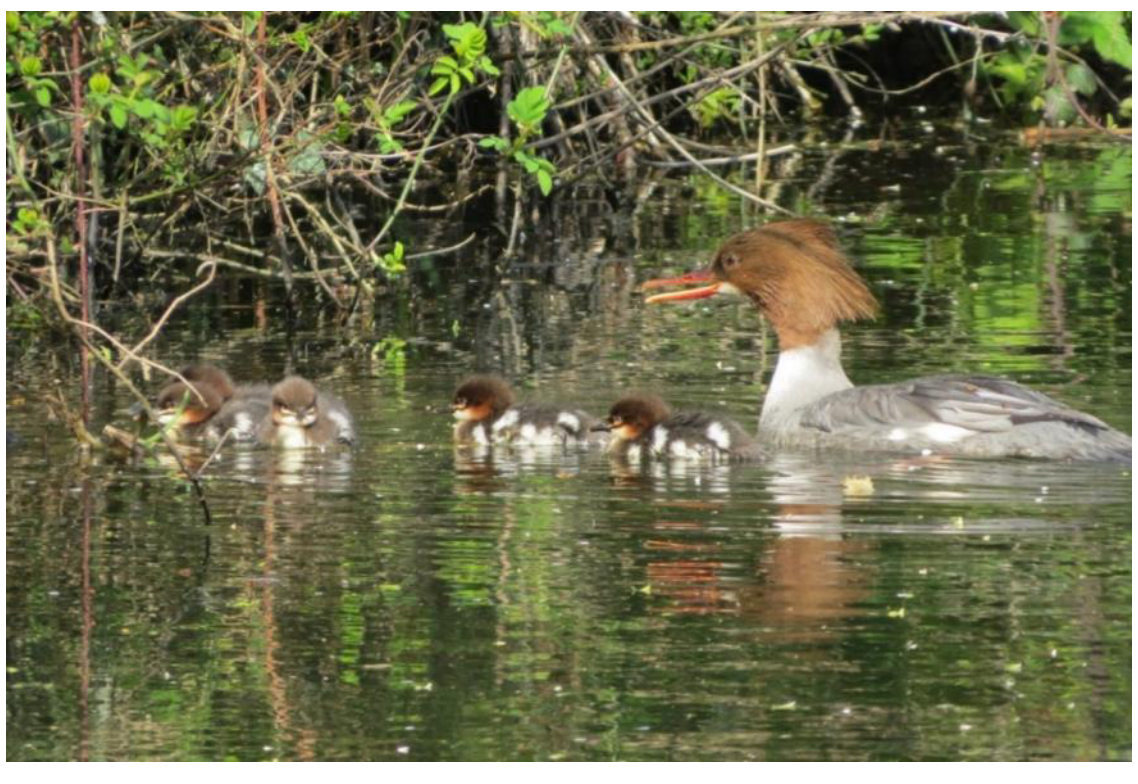
Goosander and brood on the Wern near Arddleen, 13 Apr

Widespread and recorded all year round, usually on rivers in summer but often also on large lakes in winter. Goosanders nest in holes in trees, for example at Lake Vyrnwy and along the Severn. An early brood consisted of 6 small young with adult female on the Wern near Arddleen on 13 Apr; another notable record was from the Vyrnwy Caravan Park, of one female with 22 ducklings on 3 Jun.