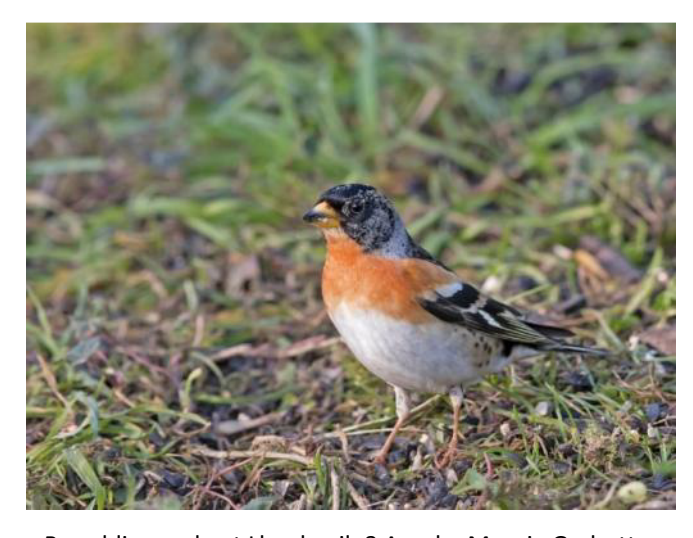
Brambling male at Llandyssil, 8 Apr, by Meurig Garbutt

A regular winter visitor to the county from Scandinavia in varying numbers. A long-staying flock at Pen-yr-Allt Wood near Llanidloes was present from 7 to 25 Jan, reaching 500 in number. A flock of 50 was at Llwynderw (nr Llanidloes) on 10 Feb. Over 100 were ringed in a garden outside Welshpool between January and April, including one originally ringed in Belgium. 30 were in a Llandyssil garden on 8 Apr., and one singing at Llwynderw, near Llanidloes, on 11 Apr. However, numbers were much reduced in the winter of 2019-20: one was on the Wern, near Arddleen on 21 Nov; and the Welshpool garden mentioned above had only two sightings of one individual at the end of the year. See also Ringing Report (below).