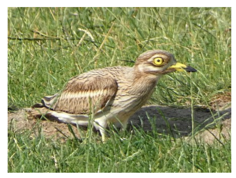
Stone-curlew juvenile at Caersws, 25 Jul

A new bird for the county: a juvenile was at Caersws on 25 and 26 July.