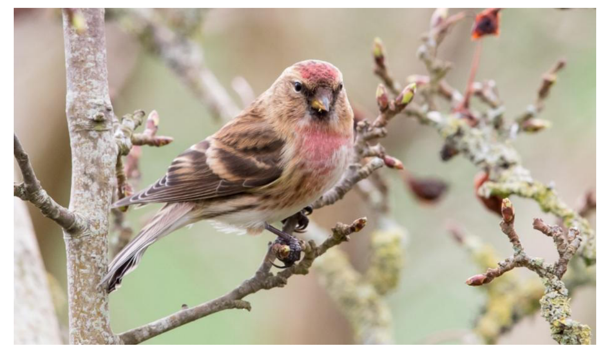
Lesser Redpoll at Sarn, 4 Mar

Lesser Redpolls are associated with birches and conifers. A spring passage through the county brings some birds to garden feeders. Some stay on to breed in fridd habitat: recently fledged youngsters were recorded at Lake Vyrnwy on 8th Aug. They are easily observed on feeders at Cors Dyfi MWT Reserve.