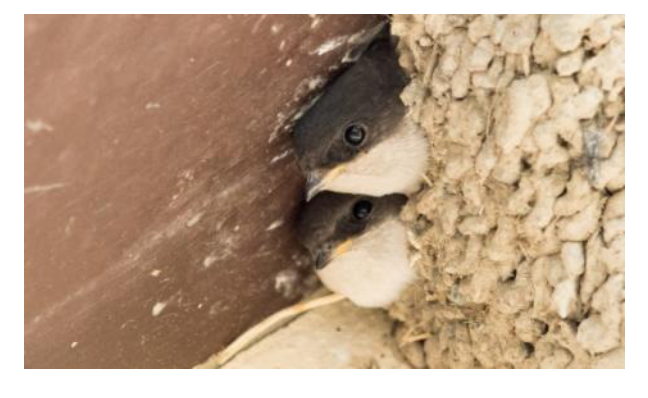
House Martin juveniles at Sarn, 8 Jul

First record was at Llyn Coed-y-Dinas on 14 Apr. Most birds return to their nesting areas in mid-May, and depart in Sep or early Oct.