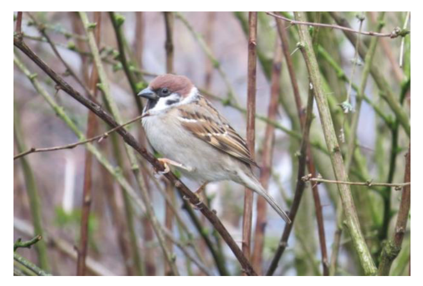
Tree Sparrow on the Wern near Arddleen, 7 Mar

Few records of this declining species. 1 was on a feeder in Llansantffraid on 16 Feb, and 4 at Wern near Arddleen from 6 to 8 Mar. A pair nested again near Churchstoke, and another pair at Tregynon. 2 were at Sarn on 31 Dec.