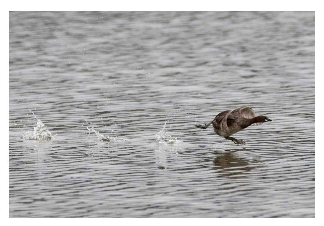
Little Grebe at Llyn Coed-y-Dinas, 18 Mar