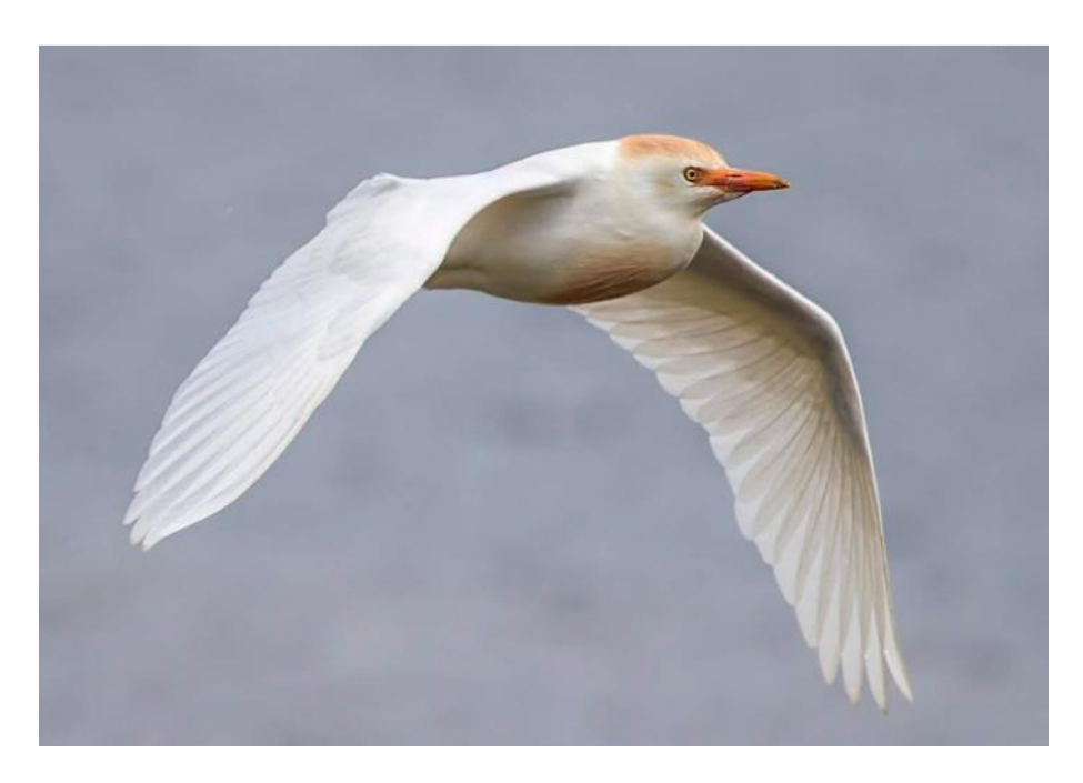
Cattle Egret at Llyn Coed-y-Dinas, 27 Apr

A single in breeding plumage was at Llyn Coed-y-Dinas on 27 Apr, but did not stay long. It was only the second record for the county, following the first at Cors Dyfi on 12 Jul 2017.