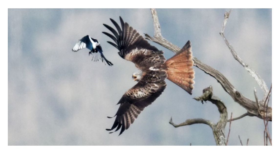
Red Kite (and Magpie) at Llyn Coed-y-Dinas, 6 Apr

According to the BTO, there has been a fourfold increase in the Welsh population of Red Kite in the last 25 years. They can now be seen over any part of the county on a regular basis. See also Ringing Report (below).