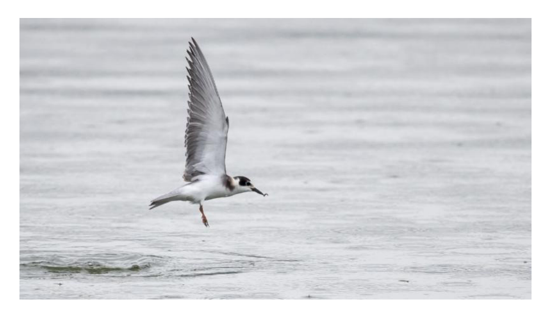
Black Tern juvenile at Llyn Coed-y-Dinas, 27 Jul

One adult was at Llyn Coed-y-Dinas on 8 and 9 May, which was watched for 6 hours on those two days, never landing during that time. A juvenile was photographed at the same lake on 27 Jul.