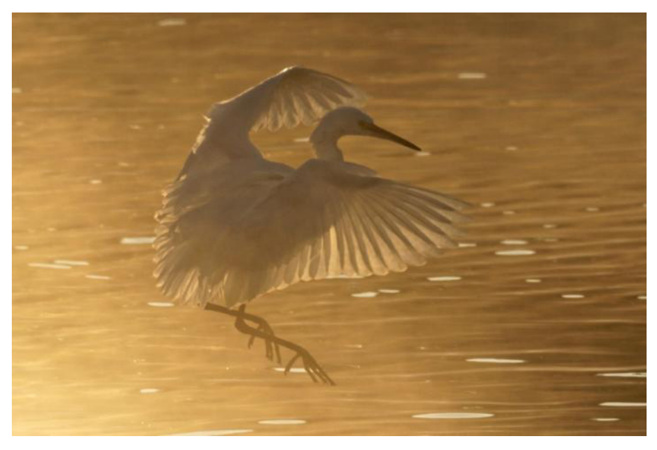
Little Egret at Llyn Coed-y-Dinas, 14 Sep, by Edd Cottell