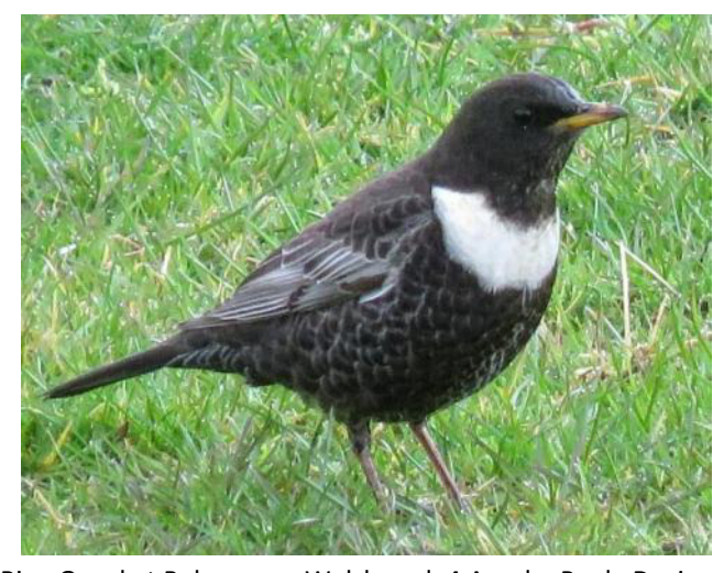
Ring Ouzel at Belan, near Welshpool, 4 Apr

A passage bird was at Belan (near Welshpool) on 4 Apr, and one in more likely breeding habitat at Cwm-cemrhiw (south of Machynlleth) on 5 Apr. A female was near the south-west shore of Lake Vyrnwy on 17 Apr, and a pair probably bred in the Llangynog area.