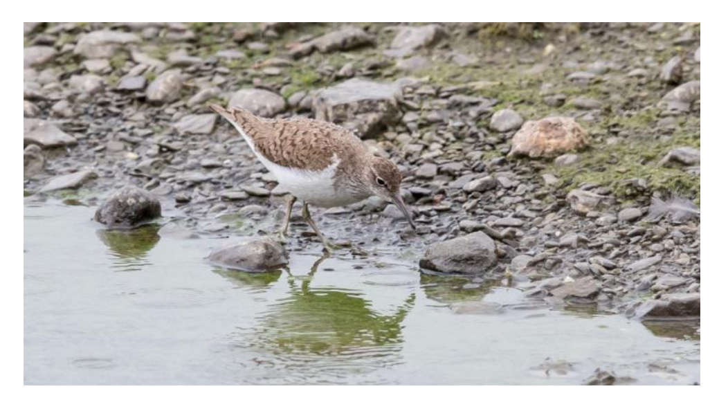
Common Sandpiper at Llyn Coed-y-Dinas, 31 Jul

First recorded on 6 April at Llyn Coed-y-Dinas and last seen there on 17 Sep. In addition to birds on passage, many nest on shingle along the county's rivers and at Lake Vyrnwy.