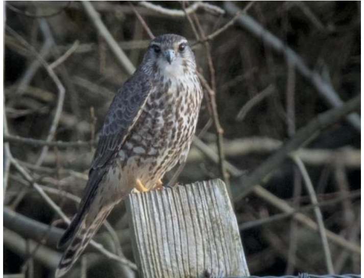
Merlin on moorland near Talerddig, 4 Feb

A female was photographed on the moors between Talerddig and Llanfair Caereinion on 4 Feb. One was reported west of Foel on 10 Jun. One pair nested in the Berwyns S.P.A., and raised 3 young. Another pair nesting near Lake Vyrnwy was just out of county. A female was seen hunting Meadow Pipits at the source of the Severn, Pumlumon, on 2 Oct; and a wintering bird was at Dyfi Junction on 9 Dec.