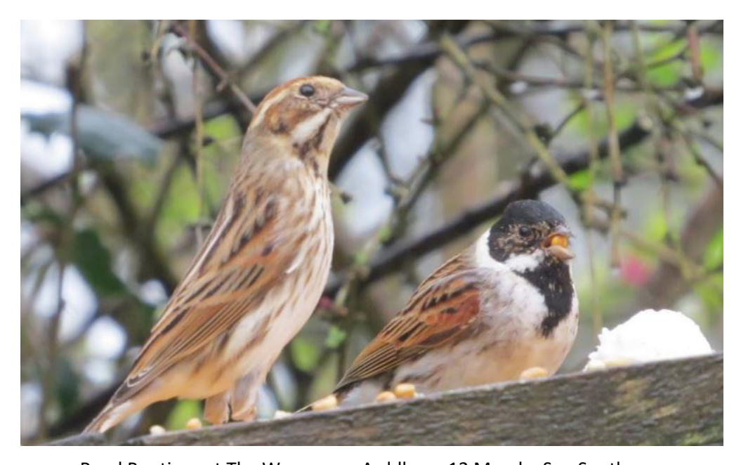
Reed Buntings at The Wern, near Arddleen, 12 Mar