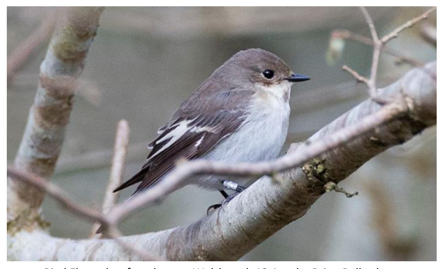
Pied Flycatcher female near Welshpool, 12 Apr

At Lake Vyrnwy, there were 110 nesting attempts in nest-boxes. Breeding success was lower than usual due to torrential rains in June. First record was on 11 Apr at Llwynderw, near Llanidloes. Pied Flycatchers are seldom recorded in late July or August as birds leave the county on early migration. See also Ringing Report (below).