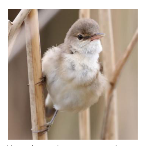
Reed Warbler at Llyn Coed-y-Dinas, 20 May

First recorded on 20 Apr at Pwll Penarth, and latest at Llyn Coed-y-Dinas on 6 Oct, where two pairs bred successfully in front of the hide. 6 were at Dolydd Hafren on 10 and 12 May.