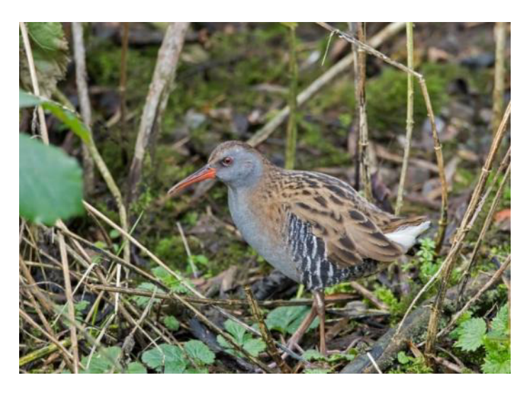
Water Rail at Pwll Penarth, 6 Feb

Mostly a winter visitor, and heard more often than seen. Singles were reported at Llyn Coedy-Dinas on 2 Jan, 25 Mar and 29 Dec. 1 was at Severn Farm Pond, Welshpool, on 10 Apr, and 2 at Pwll Penarth Newtown, on 6 Feb and 24 Dec. 3 were present at Dolydd Hafren on 15 Oct.