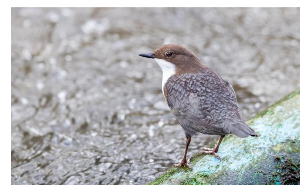
Dipper at Sarn, 16 Feb

Dippers can be found throughout the year on fast-flowing streams and rivers throughout the county. The species is the subject of a local ringing programme (see Ringing Report below). 2019 was a poor breeding season within the study area.